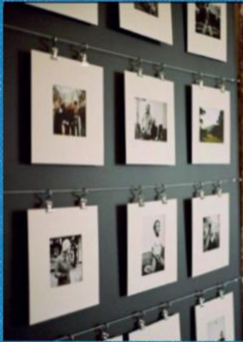
This Wall of Farmer Fame features the meat farmers who provided the products stocked in the meat counter.