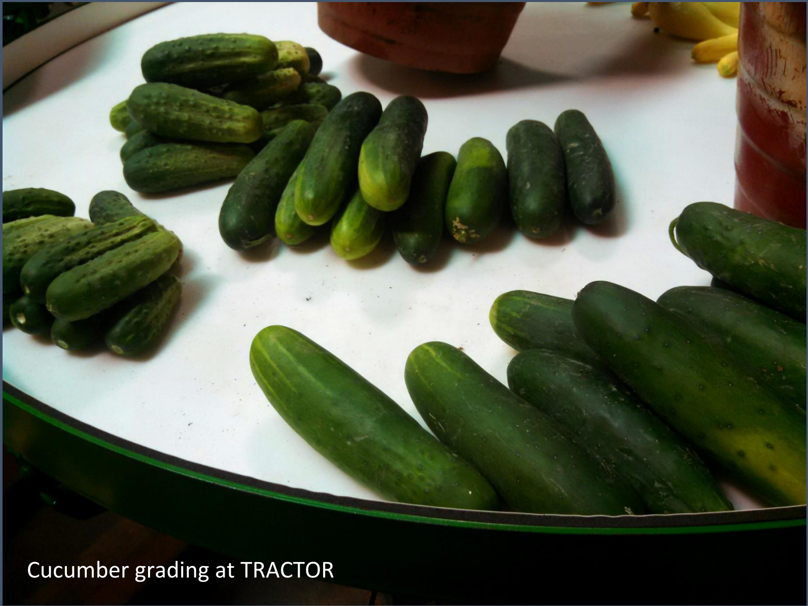
Cucumber grading at TRACTOR