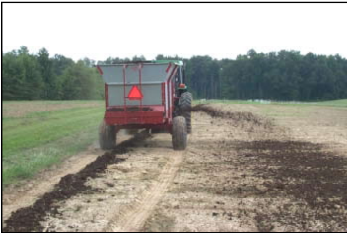
Figure 2. Applying compost prior to planting winter wheat at CEFS

The organic matter in compost can help to raise the cation exchange capacity (CEC) of your soil. The CEC is an indicator of the soil's ability to hold nutrients, allowing them to be available for plant uptake and keeping them from leaching away. In addition, the increase of organic matter from repeated applications of compost can help to raise the pH of acid soils.